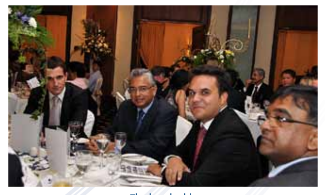
The head table