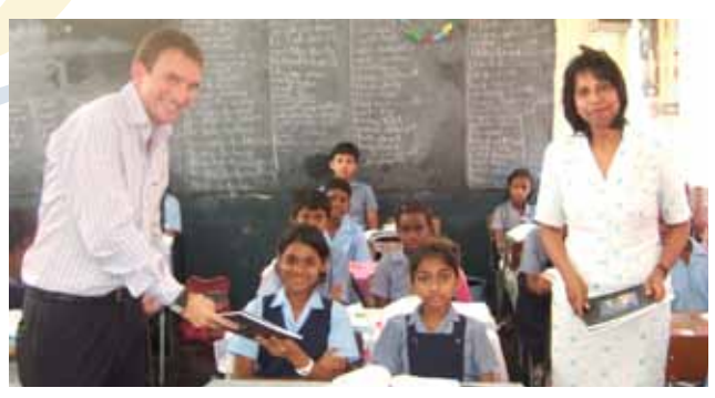
Distribution of books in a ZEP school

2200 reading sessions were conducted. Around 3000 pupils benefited from the project. Books and stationeries were distributed to all ZEP Schools. Several schools benefited from photocopying machines, PCs, LCD projectors and screens.