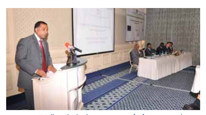
Hon. T. Pillay Chedumbrum, Minister of Information and Communication Technology, addressing the audience at the workshop

- Study on the Electronic System for the submission of Trade Documents