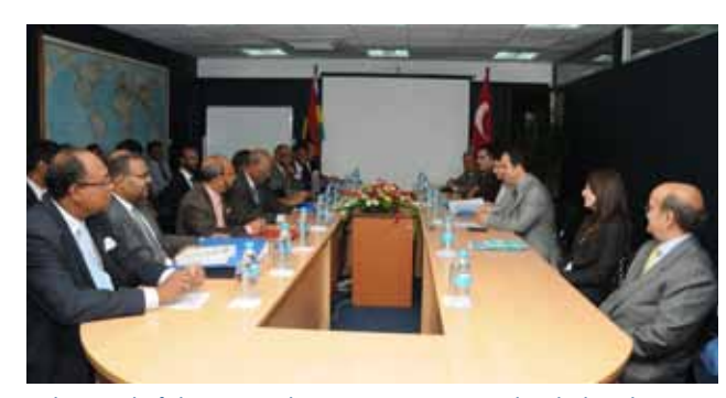
5th Round of discussions between Mauritius and Turkish Delegation in January 2011

The MCCI was closely involved in the successive rounds of negotiations for the setting up of a Free Trade Area (FTA) between Mauritius and Turkey. Significant progress has been achieved and the negotiations were concluded during the last round held in Mauritius in January 2011.