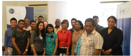
Legend: Participants of the Training with our 2 MQA Approved Trainers (Centre).

The number of participants is growing annually and as at date, some 352 participants have followed the training. Participants include new and existing GS1 Subscribers, solution providers involved in quality control, logistics, supply chain management, printing and even commercial activities like supermarkets. A certificate of attendance is given to participants and the course is HRDC Refundable. Regular feedback from supermarkets has revealed that the printing and quality of barcodes have improved tremendously contributing to less scanning errors and less waiting time at Point of Sale.