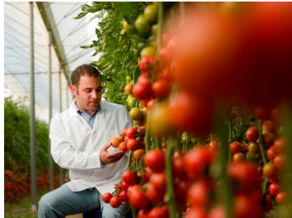
Ensuring sustainable practices in agriculture

This paves the way for smaller farmers in developing countries to be recognised for sustainable practices, opening up potential markets and allowing them to become more visible. Furthermore, multinationals can identify sources of food that are sustainable and consumers gain better visibility to make informed purchase decisions.