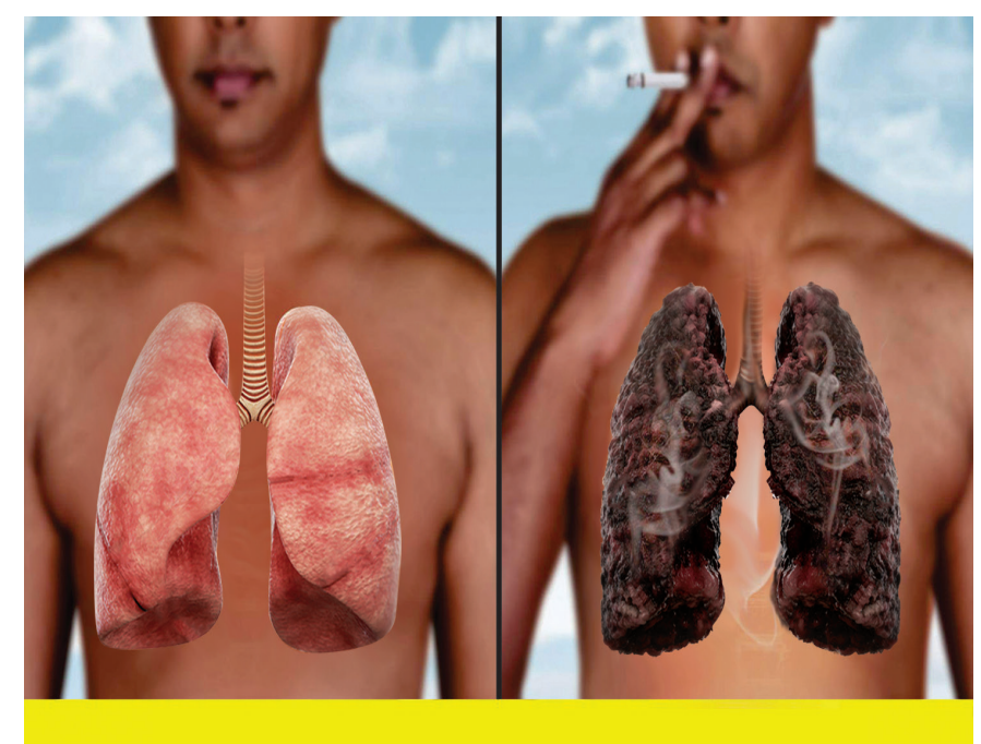
SMOKING CAUSES LUNG CANCER