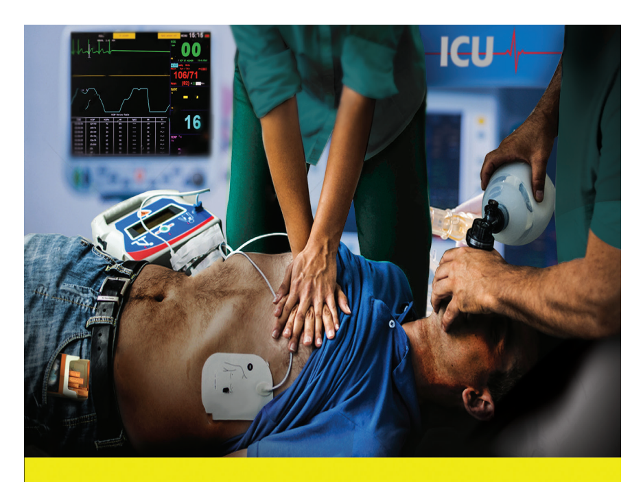
SMOKING CAUSES HEART DISEASES