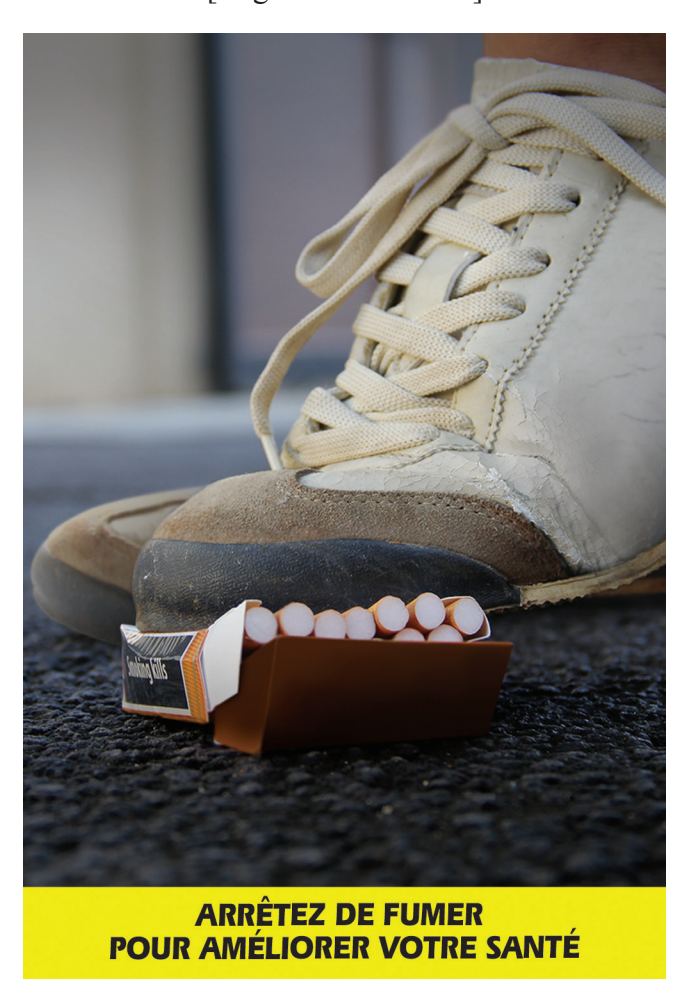
THIRD SCHEDULE [Regulations 4 and 8]