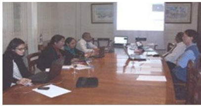
The Webinar training was hosted by the MCCI

The participants to the webinar included representatives of the Ministry of Foreign Affairs, Regional Integration and International Trade, the Ministry of Industry, Commerce and Consumer Protection, the Association of Mauritian Manufacturers and of the MCCI.