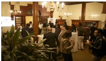
La 2ème édition du 'Networking Event' de MARC a eu lieu à la MCCI